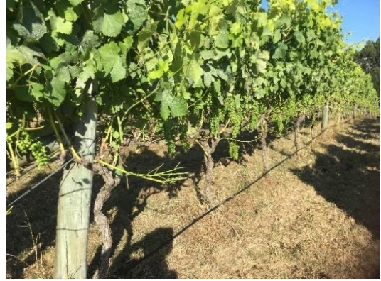
Pinot Noir post-leaf plucking the vines using sheep around Christmas

In spring fungicide spraying starts in earnest. We could spray 15-20 times/season, (more than a conventional vineyard). The programme is based on proactive application of sulphur sprays with restricted use of copper. Without herbicides weed control is by under-vine trimming and cultivation (with variable success), complemented by regular inter-row mowing. Sheep are also used in winter and at times in summer for leaf plucking around the fruiting zone.